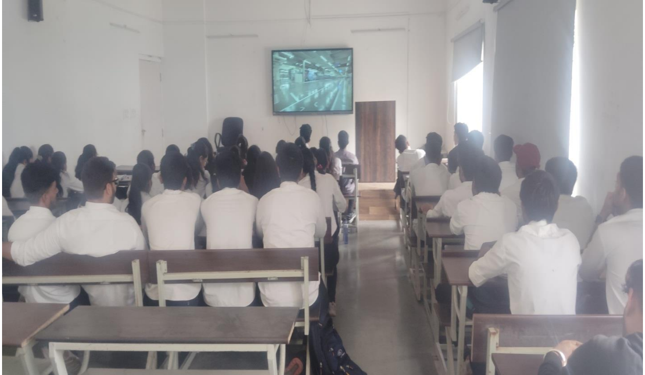
A Story of Kargil war was shown to the students