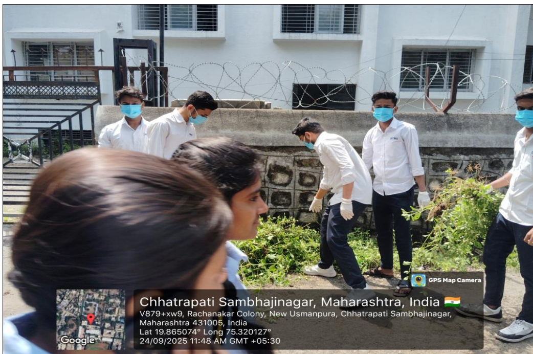
NSS Volunteers actively participating the cleanliness drive.