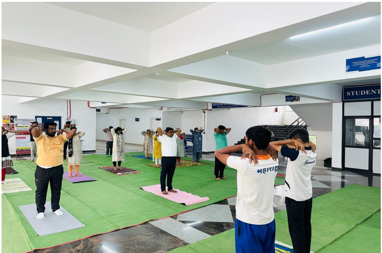
Participants performing yoga