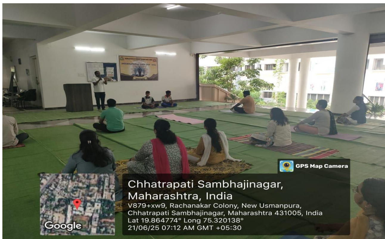
Participants setting in the tight posture and listening to the instructions