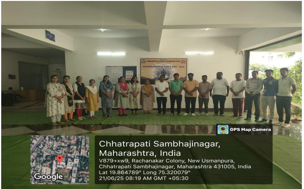
Teaching staff group photo after Yoga Session