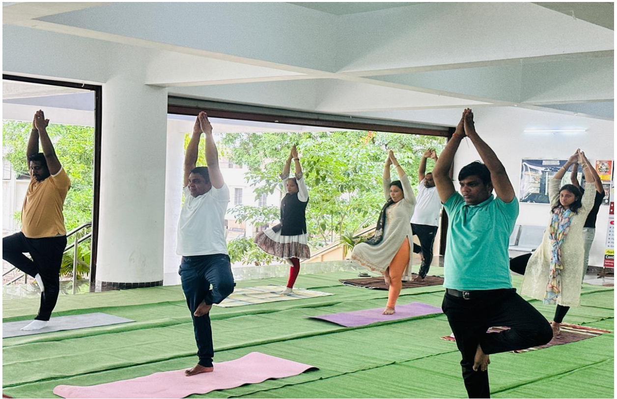
Participating performing Yoga